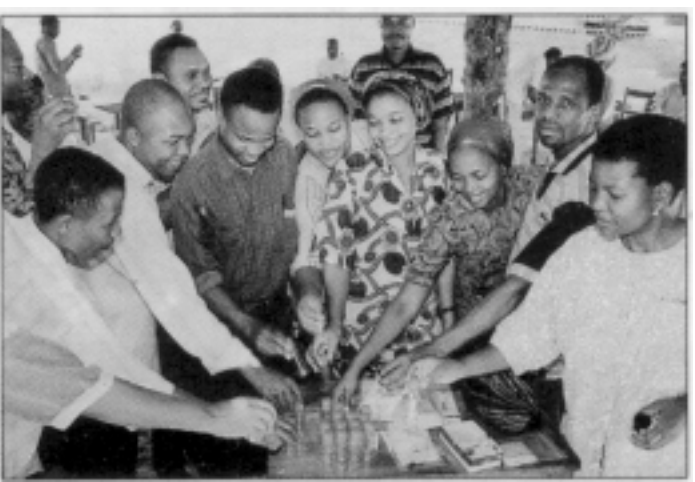
Doctors in Kisantu, Democratic Republic of Congo, learn to make medicines themselves.